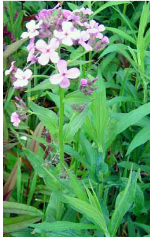
Dame's rocket flower and leaves.

The seed pods of dame's rocket strongly resemble the seed pods of Garlic Mustard—another plant in the mustard family that is invasive in the Barrington area.