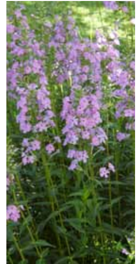
Wild sweet William. Phlox maculata .

Dame's rocket grows in moist woodlands, woodland edges, roadsides, railroad rights-of-way, disturbed sites, waste ground, thickets, and open areas.