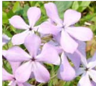
Five petals on Phlox divaricata .