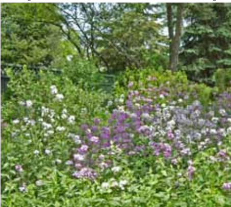
Dame's rocket flowers in their multiple colors.