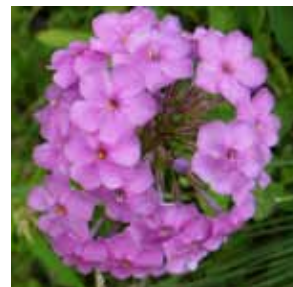
Five petals on marsh phlox. Phlox glaberrima .