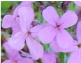
Four petals on dame's rocket.