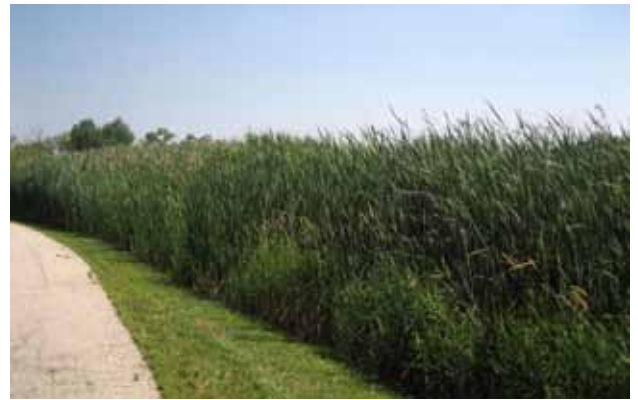
Common reed in North Barrington.