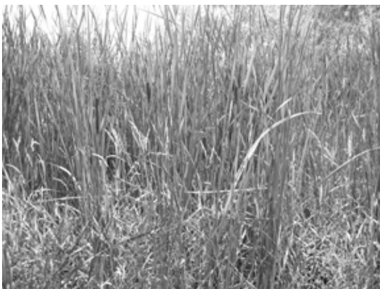
Invasive triple-threat: common reed, cattails and reed canary grass.

After removing common reed, replace it with a native grass that grows in the same habitat. It should thrive.