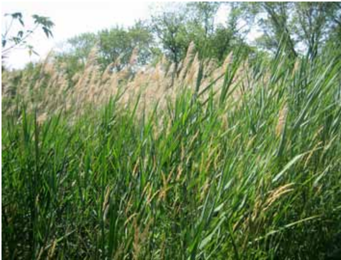
Phragmites like a grassy forest.

Common reed is a tall, perennial wetland grass ranging in height from 3 to 20 feet. Strong, leathery horizontal shoots called rhizomes growing on or beneath the soil surface give rise to roots and tough vertical stalks. Cane-like stems 1 inch in diameter support broad sheath-type leaves that are .5 to 2 inches wide near the base tapering to points at the end. Plants produce large, dense, feathery, grayish-purple plumes 5 to 16 inches long in late June through September. The reeds turn tan in the fall and most leaves drop off, leaving only the plume-topped shoot. The root system is comprised of rhizomes that can reach to 6 feet deep with roots emerging at the nodes. Common reed reproduces by these spreading rhizomes and forms large colonies.