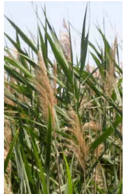
Common reed seed heads.

Common reed thrives in sunny wetland habitats. It grows along drier borders and elevated areas of brackish and freshwater marshes and along riverbanks and lakeshores. The species is particularly prevalent in disturbed or polluted soils with alkaline and brackish waters but will tolerate highly acidic conditions. It can grow in water up to 6 feet deep and also in somewhat dry sites. It can be found along roadsides, ditches, open wetlands, riverbanks, lake shores, dredged areas, and disturbed or undisturbed plant communities.