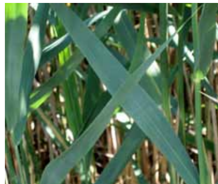
Common reed stems and leaves.