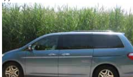
Common reed with car for height comparison.