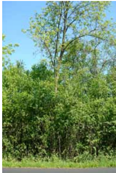
Buckthorn choking trees along roadside.

Prolific seed production allows buckthorn to flourish. Female specimens produce numerous small, black, berry-like fruits most of which fall directly under the shrubs creating an impenetrable mass of seedlings; birds eat other fruits and carry them far beyond the mother shrub. Because birds have difficulty digesting the fruits, they rapidly expel the seeds (note the species epithet, cathartica ). Thus, the shrubs reproduce and spread rapidly.