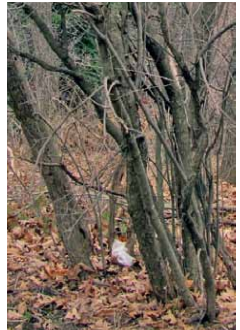
Mature and young buckthorn bark.